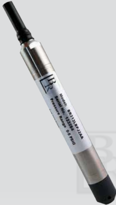
Model BR313L Submersible Level Transmitter